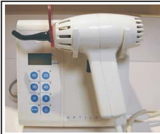
Photopolymerisation 30 sec.per tooth.