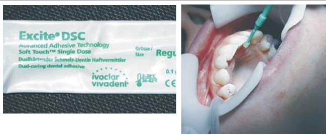
Applying of Excite on the lingual tooth surfaces.