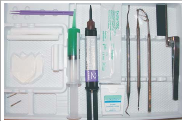
2 Necessary orthodontic instruments