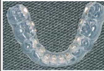
1 Transfer tray, set-up models and screenshots