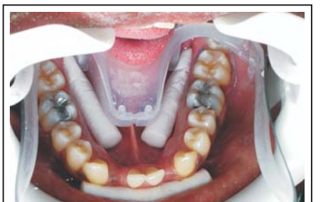
For lower arch bonding center the tongue cage with 2 salivary cottons.