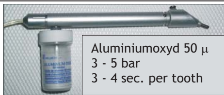
Aluminiumoxyd 50 µm 3 - 5 bar 3 - 4 sec. per tooth