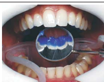
Preparation of the lingual surfaces (37% phosphoric acid, aspirate, rinse, dry) and visual control.