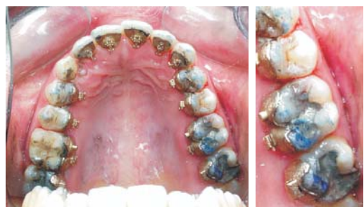
Checking the occlusal surfaces