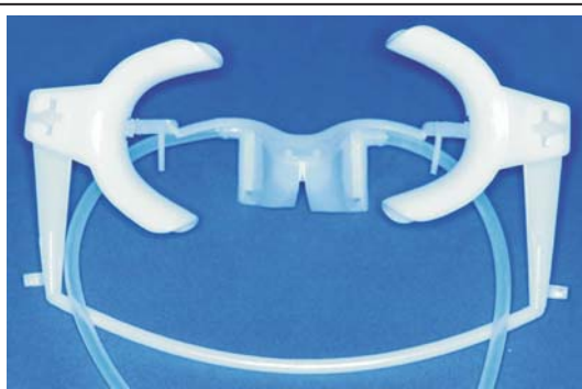
DRY-Field-System by NOLA Insert Dry-Tips in each cheek.