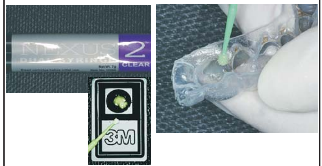
Applying of Nexus on bonding surfaces of the Incognito bracket in the transfer tray.