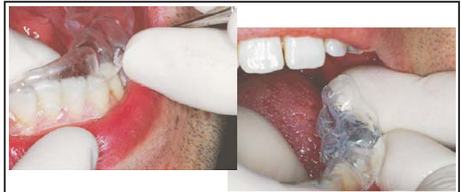
Taking out of the transfer tray in two steps, first take out the more rigid tray then the more softer one, beginning in the back and working forward and from the outer to the inner side.