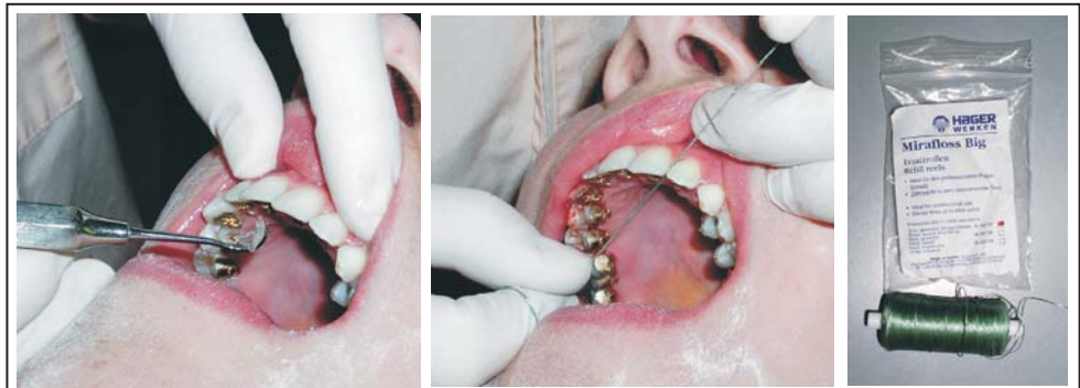
Elimination of adhesive residues with the shure, scaler and dental floss. Please do not forget to clean the vestibular surfaces too.