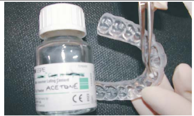
3 Verification and cleaning of the transfer tray with acetone.