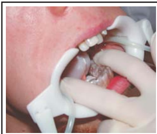
Insertion of the transfer tray. Hold the tray without pressure